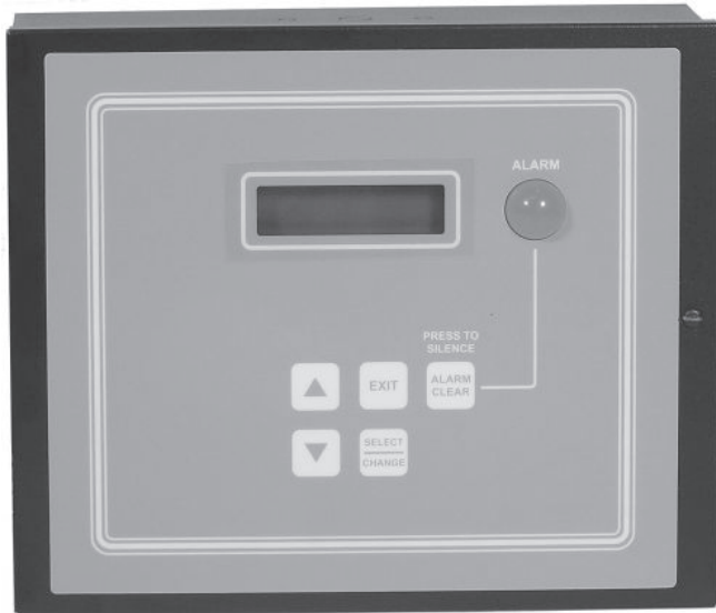
WALK-IN MONITOR (WIM2-L)