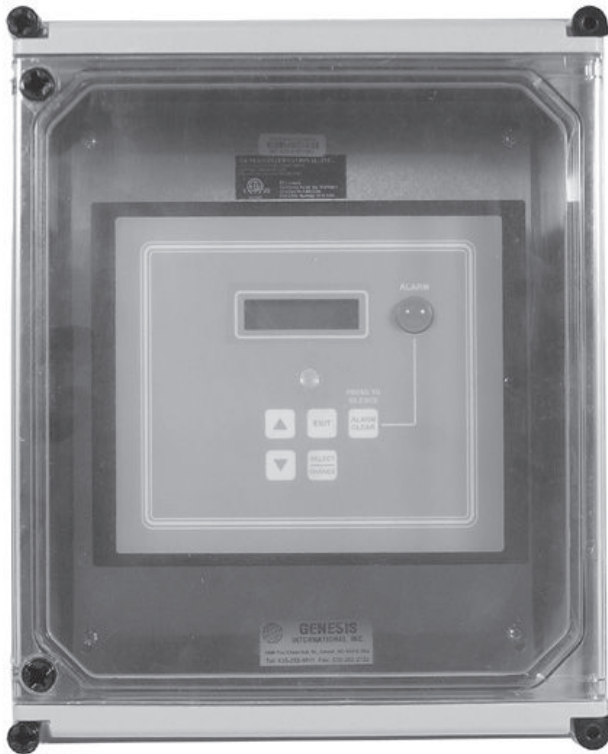
WALK-IN CONTROL (WIC-L-4) Part Number 88-0577

The Wizard Single Zone Cooler Control System with Refrigerant Leak Option NEMA 4X (WIC-L-4) was designed to incorporate most of the control functions necessary to monitor and control the evaporators of a walk-in cooler and freezer of a supermarket, convenience store or restaurant into a compact, simple to install package. The WIC-L-4 utilizes the latest microprocessor technology with two row 16 character LCD back-lighted display. Plain English menu driven user interface is easy to understand and manipulate. It is equipped with a real time clock with a 5 day power loss backup. The control has as standard, an onboard 95db buzzer and a red light that will notify of an alarm. The unit is standard with 4 SPDT relays. A single Control can replace the following items for a complete Walk-In unit: