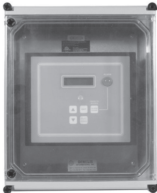
WALK-IN MONITOR (WIM2-L-4) Kit Part Number 88-0513-00 with Two Room Temperature Sensors

The Wizard Dual Zone Walk-in Cooler Monitoring System with Leak Detection in a NEMA 4X Housing (WIM2-L-4) is an ETL approved monitor and was designed to incorporate most of the functions necessary to monitor the evaporators of a walk-in cooler and freezer of a supermarket, convenience store or restaurant into a compact, simple to install package. The Control utilizes the latest microprocessor technology with two row 16 character LCD back-lighted display. Plain English menu driven user interface is easy to understand and manipulate. It is equipped with a real time clock and a 5 day power loss backup. The control has as standard, an onboard 95db buzzer and a red light that will notify of an alarm. The unit is standard with 6 SPDT system alarm relays (One Silence-able, One Non Silence-able System alarm and four refrigerant leak relays for 2 discrete alarm levels). A single Wizard Walk-in Monitoring System can replace the following items for a complete 2 system Walk-In unit: