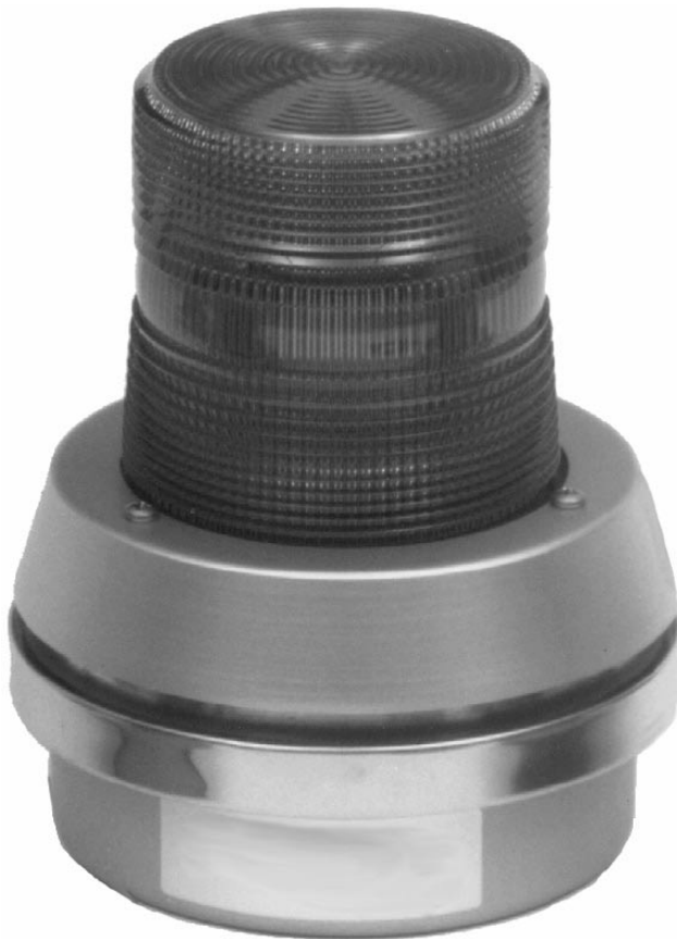
ADAPTABEAACON HORN / STROBE

The Genesis flashing lights with horns are designed to provide a bright visual indication utilizing special optics within a shatter resistant polycarbonate lens. The polycarbonate double fresnel lens ensures efficient light dispersion. This is accomplished with a series of complementing fresnels that cause the dome to “fill” when the light is operating. Beam distance is also increased with fresnel lenses. Lenses are available in six colors: red, amber, blue, green, magenta, and clear. The unique base design allows horn audibility while maintaining the unit’s weatherproof integrity.