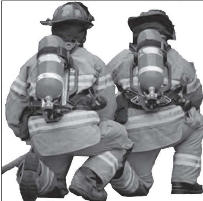
PSS 7000 SCBA PART #88-0664

NIOSH APPROVED 30 MINUTE DURATION PART NUMBER 88-0664