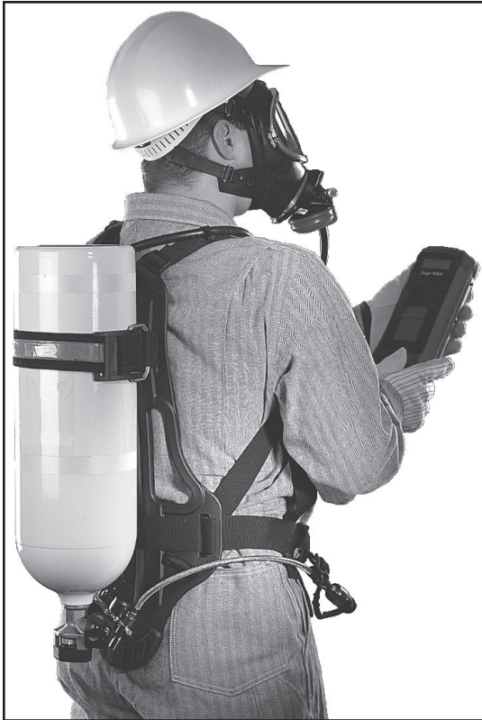
PAS LITE® SCBA PART# 88-0656