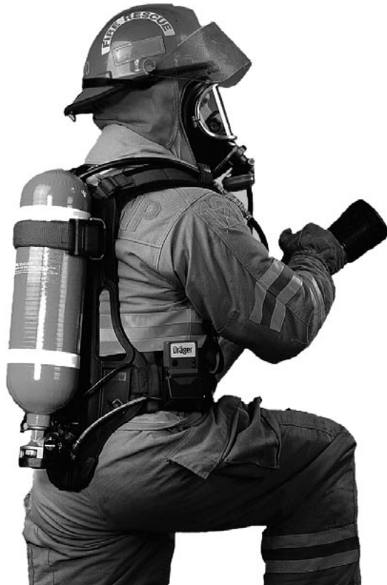
AIRBOSS SCBA PART #88-0237