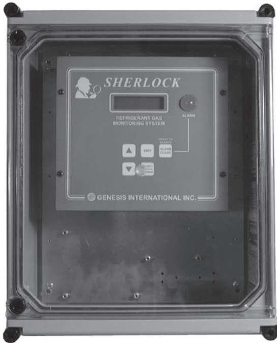
SHERLOCK 102 CONTROL